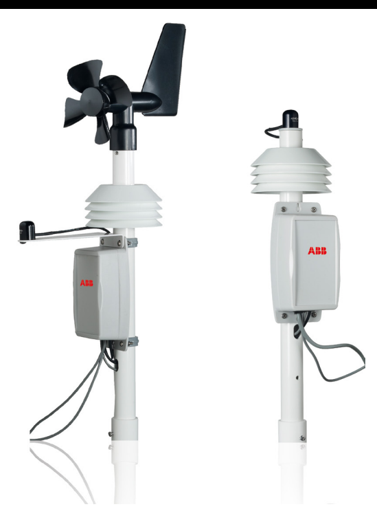
ABB monitoring and communications VSN800 Weather Station

The VSN800 Weather Station automatically monitors site meteorological conditions and photovoltaic panel temperature in real-time, transmitting sensor measurements to the Aurora Vision® Plant Management Platform.